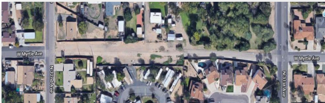
Myrtle Avenue between 31st and 32nd Avenues