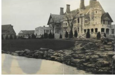
537 Circle Dr. In the 30's

Did you know that the Denver Public Library has a online searchable archive? This resource is a wonderful way to research the history of your home and our neighborhood. The library's online collection contains is filled with photographs, maps, architectural drawings and other documents from the collections of the Western History/Genealogy Department chronicling the people, places, and events that shaped the settlement and growth of the Western United States. New images are continually being added chronicling the ongoing of our city and the general development of Western America. The library also has Real Estate and Fire Insurance Atlases, Denver Building Permits, Assessor Records and much much more.