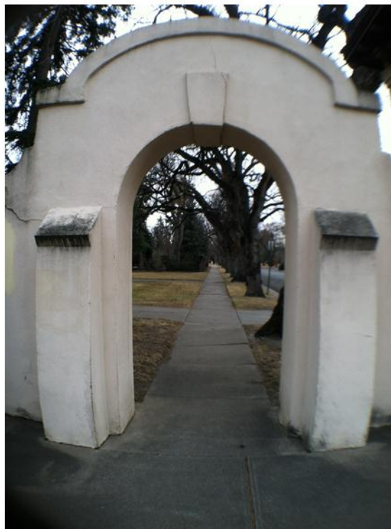
Arch at 4th and High