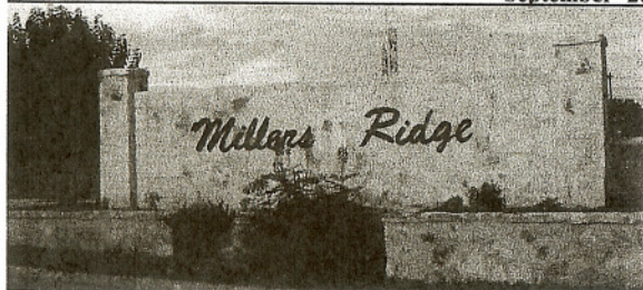
Millers Ridge New Rock Marquee (Day time)