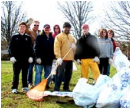
Cleaning up Beechmont