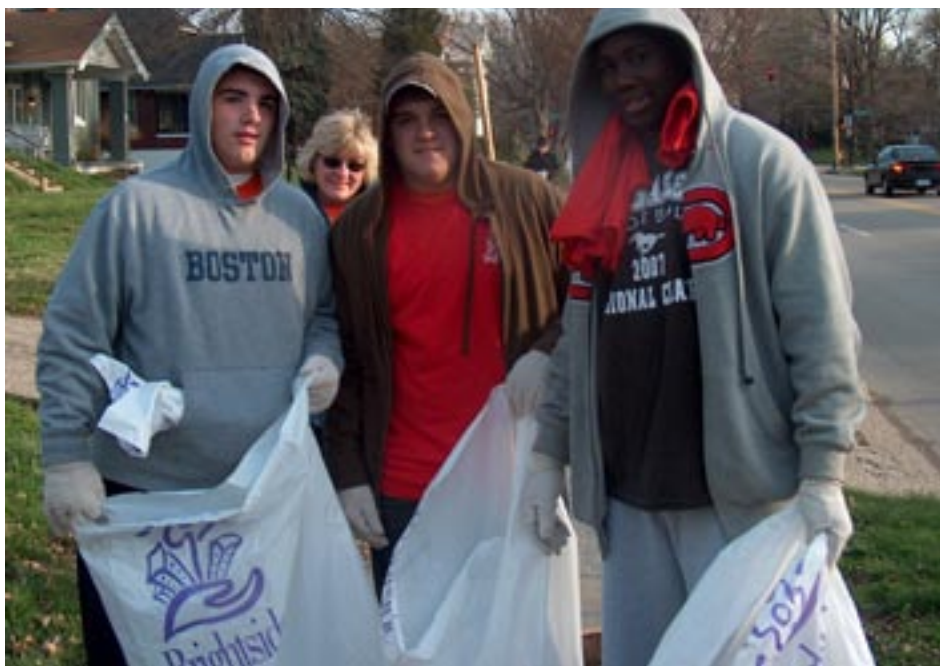
DeSales Students Help With Cleanup