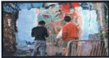
If done without permission...is against the law.

Graffiti is words, colors, and shapes drawn or scratched on buildings, overpasses, train cars, desks, and other surfaces. Its done without permission and is against the law. Graffiti sends the signal that nobody cares, attracting other forms of crime and street delinquency. Fortunately, there are things we can all do to eliminate and prevent graffiti in our city.