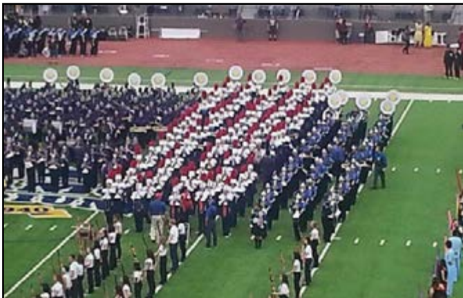
Congratulations to the Jefferson Mustang Band who took first place in Category 5A at the 2015 Fiesta Battle of Flowers Band Festival.

My favorite one: "Help Seniors Stay in Their Homes, Shop at Jefferson Thrift Store"