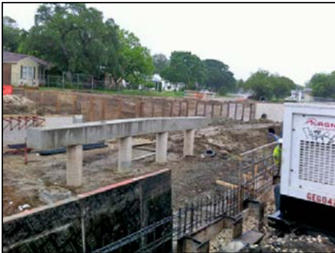
Channel bottom prep work for concrete at Wilson St. bridge