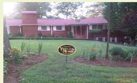
YOTM Recipient July 2014- Gore residence 3511 Heritage Valley