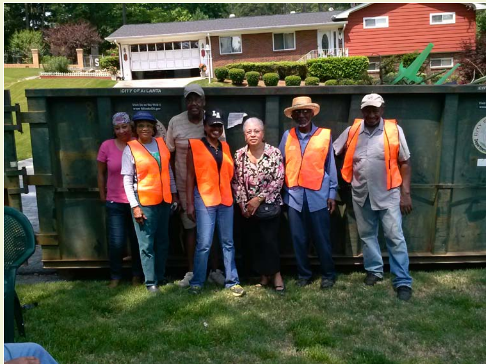
HV MEMBERS POSE FOR A PICTURE AFTER MAY 2014 NEIGHBORHOOD CLEAN-UP!