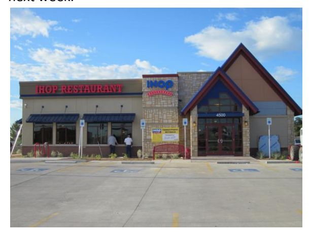
IHOP on HOndo Pass

Opening Monday on Hondo Pass, IHOP will give us more variety. IHOPefully they will become a business member soon after the grand opening next week.