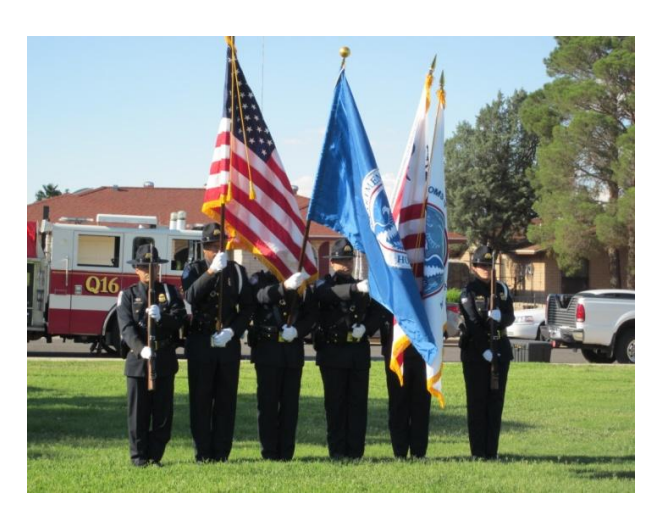
CBP Color Guard