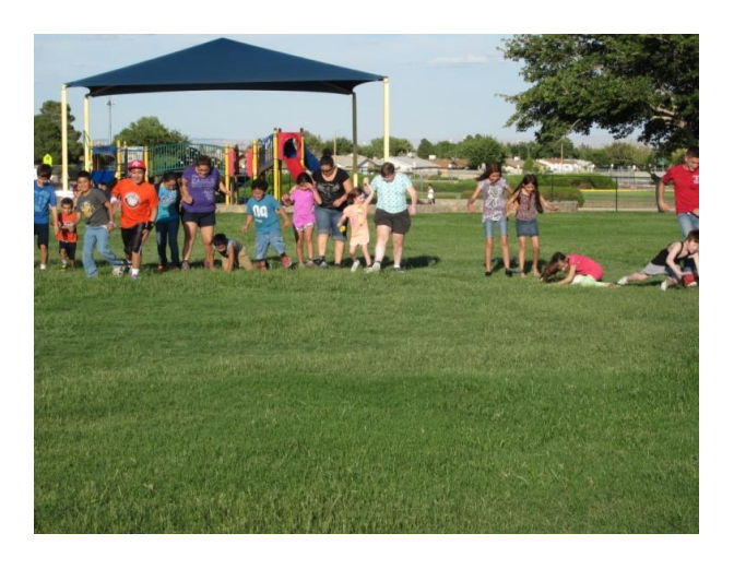
Three Legged Race