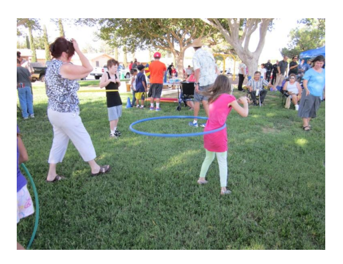
Swing It All Night Long!