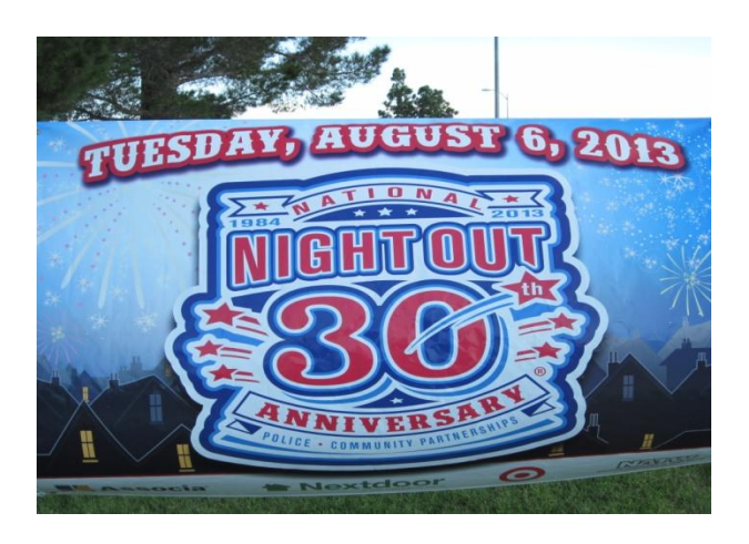
NNO Turns the Big 30

National Night Out- CHNA has the best party in town with more than 200 in attendance.