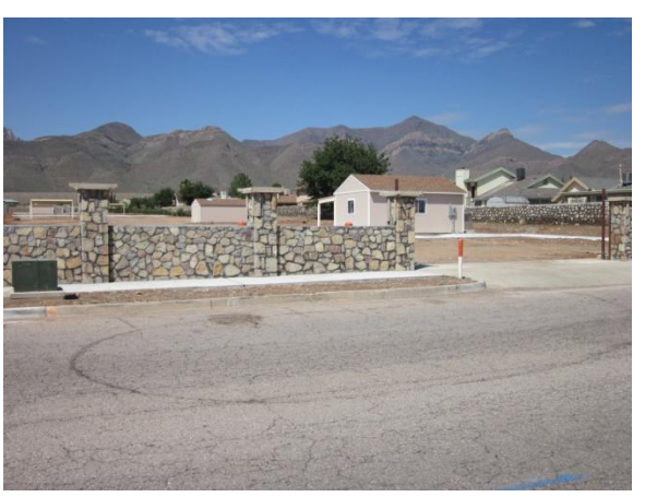
Yerbey Gardens Progress

Can't wait for it to open and for the dirt retaining wall to come down.