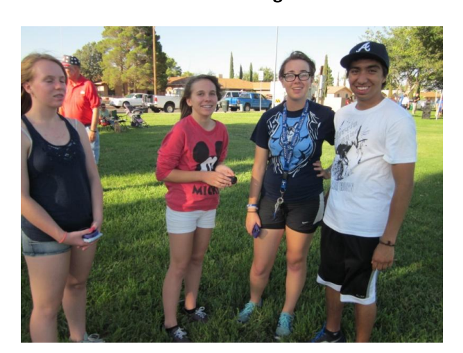
Teens Loving It