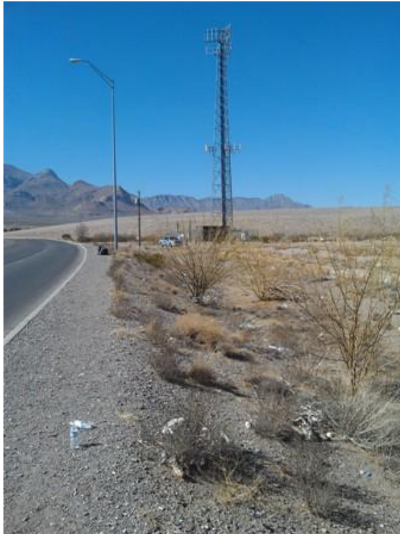
Before the Clean-up