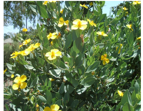
From Left to Right: Manzanilla Poppy, Cleveland Sage, California Sunflower