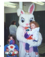
Even the Easter Bunny finds time to volunteer for the LBNA!

Please contact any of the committee chairpersons if you are interested in volunteering. Your assistance is both welcomed and appreciated!