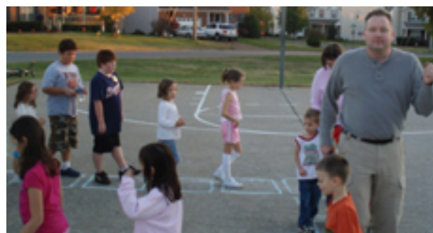
Happy Kids = Happy Parents!