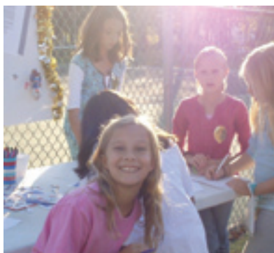
Letters to the Troops!