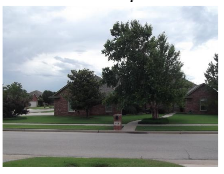
JULY YARD OF THE MONTH 11712 NW 6th St