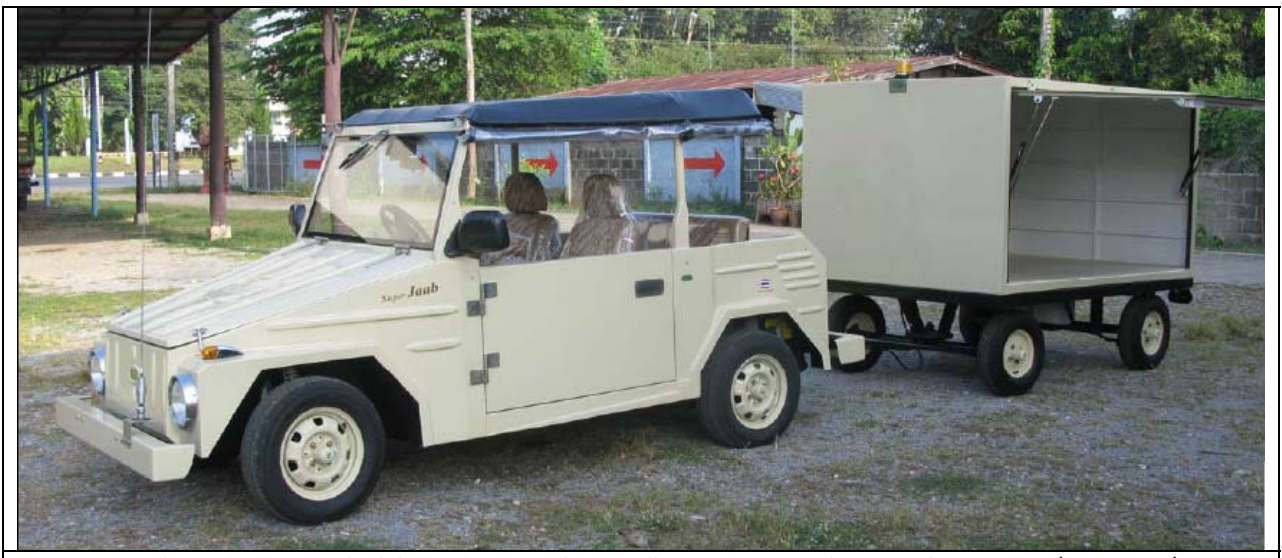
Sparky and Sam, newly delivered prior to the installation of any RTC-TH EmComm gear (~Oct 2009)

Some of you participating in GERC Field Days have undoubtedly grunted and groaned lifting and lugging wet cell batteries to set up your rigs. Well, I didn't relish the idea of being a lone operator struggling with all this stuff. So with Sparky (who sports 8 batteries + an optional spare) and Sam (with 2 batteries + 1 optional spare), I can ride my batteries to a field day!