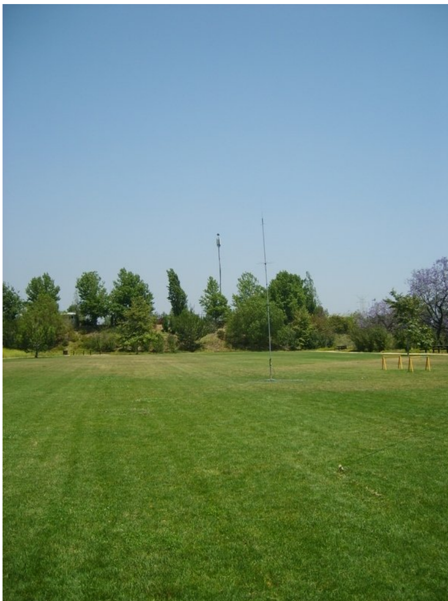
The antenna was set up in the middle of the field about 75 feet from our station