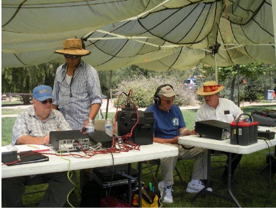
L to r: N7YLA, KI6CEW, W8LH, KG6TRD