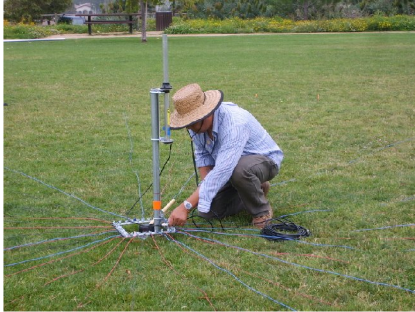
KI6CEW installs radial ground wires