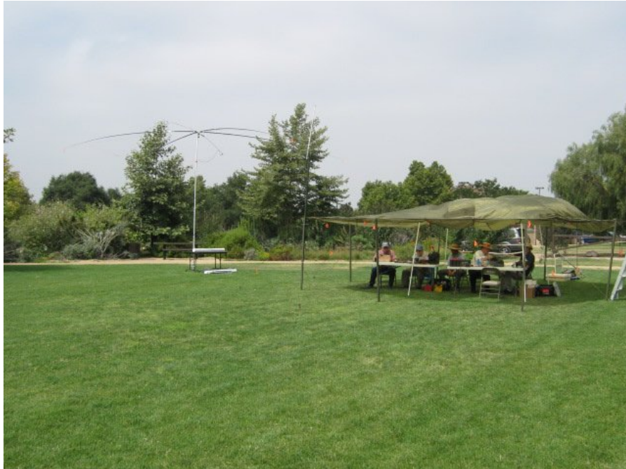
Spider beam antenna at left