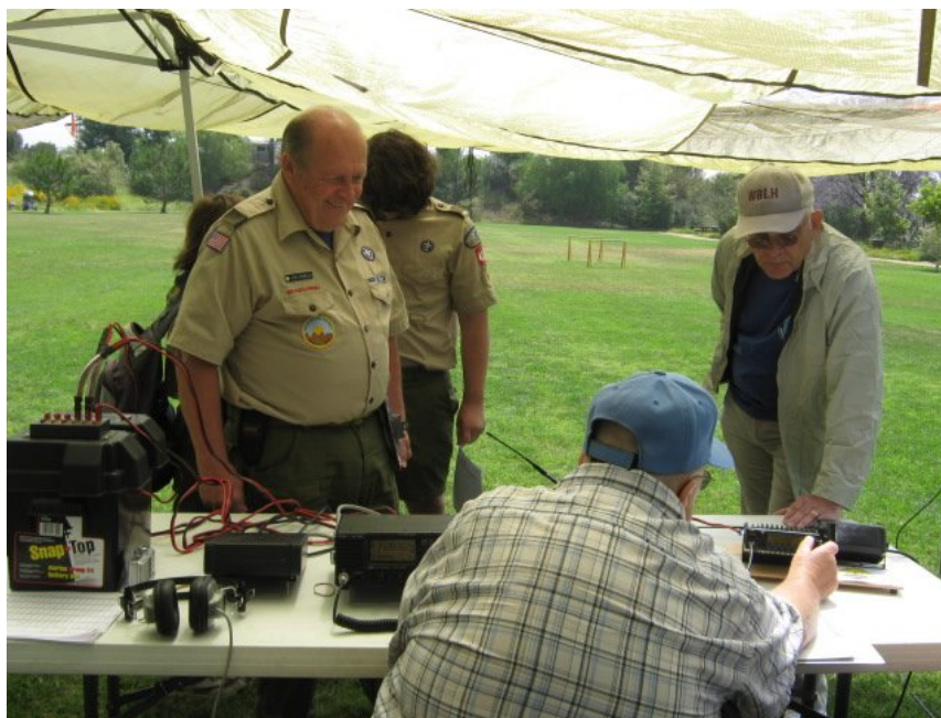
A contact was made on the Catalina Repeater for the Scouts.