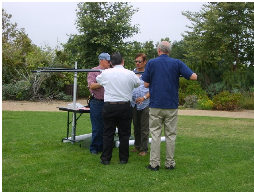
Setting up the 20 meter Moxon "Spider Beam"