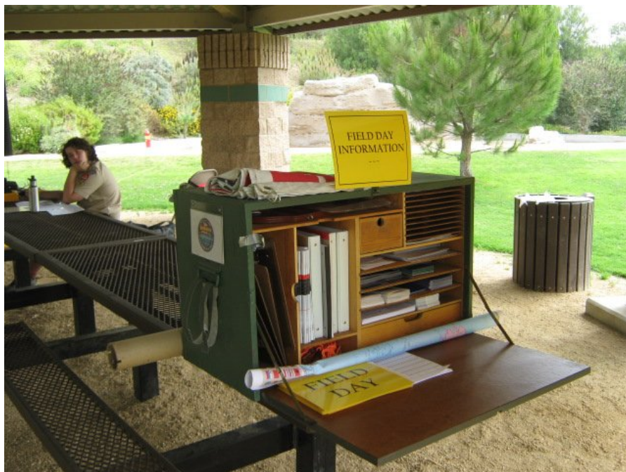
GERC Information station