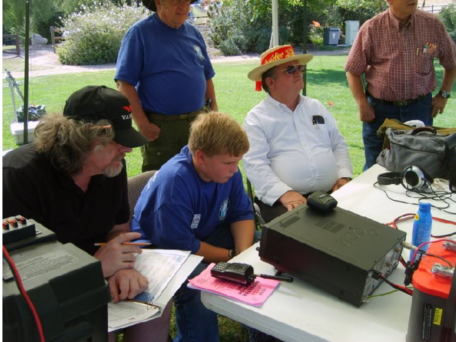
KG6MXP and KI6YBW listen intently