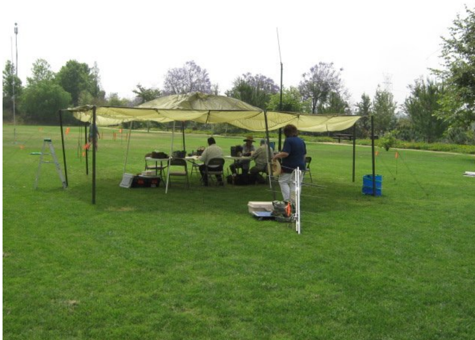
Getting ready for the contest that started at 11:00 am local time.