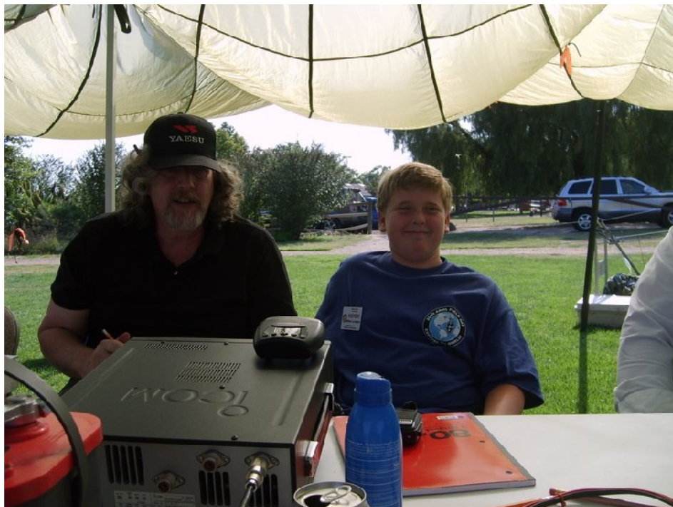
Contacts made to stations in Idaho and Utah!