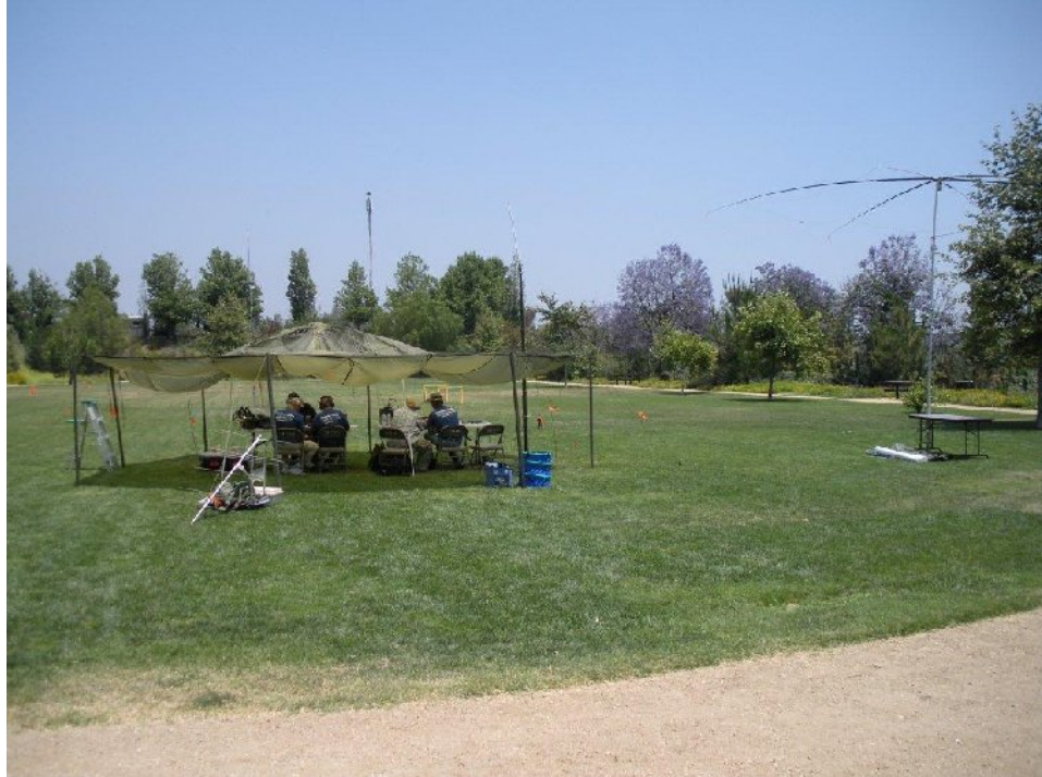
Horsethief Canyon Park is an excellent location.