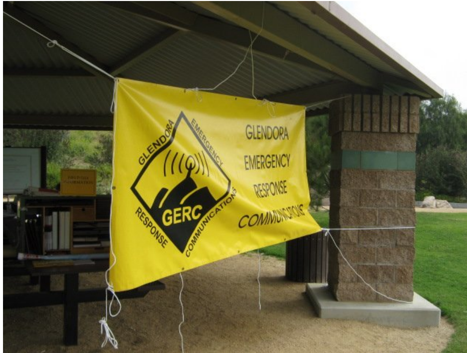
OUR LOGO !