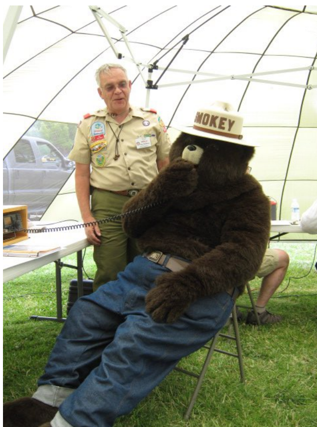
And so did Smokey the Bear!