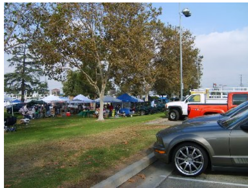
But we set up our station in the parking lot near the police station.