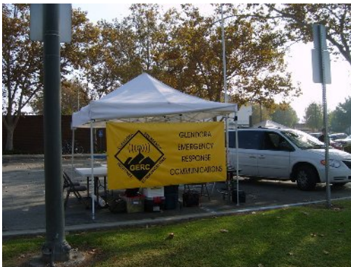
Our station is set up and