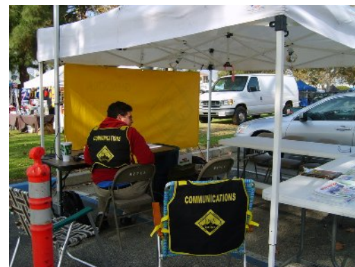
our Net Operator all day!