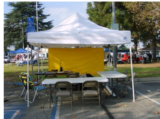
Ready to go by 9:30 am!