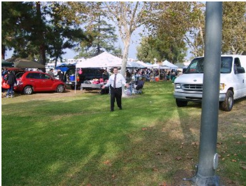
Jonathan, KG6TPZ was in charge of the volunteers who helped set up the vendor's booths in the park.