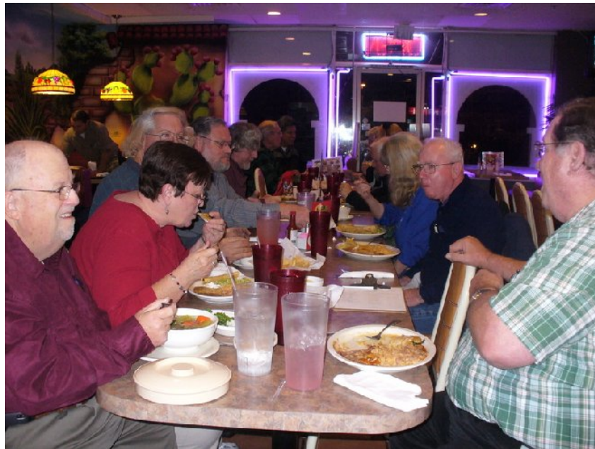
Plenty of good eats!