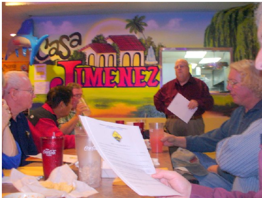
N7YLA announces the proposed Operating Event in May, 2010