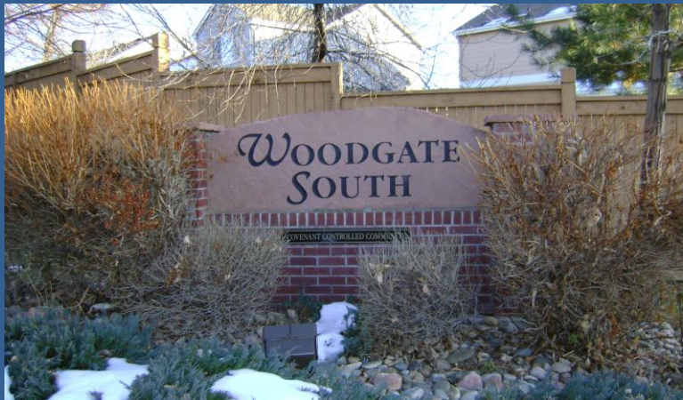
Woodgate South Aurora, CO