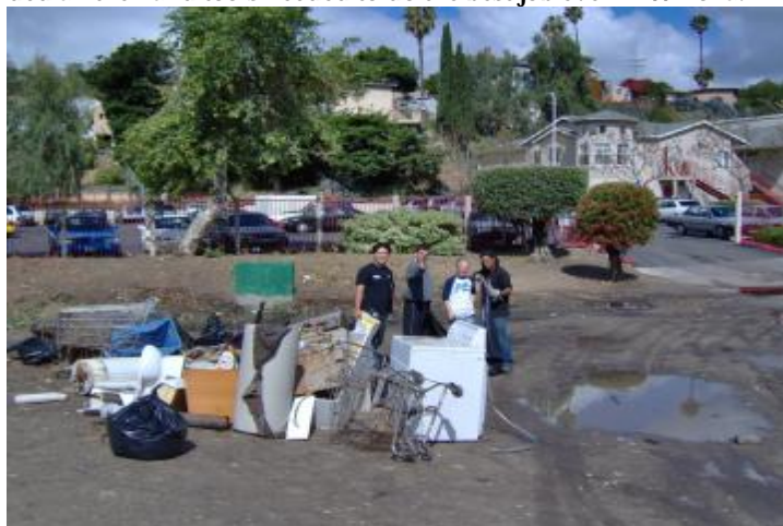
At the end of the day, the Red and Blue Teams removed trash, small/large and bulky items out from the Auburn Creek channel [from 50 th Street, along Landis, Winona and all of Ontario Avenue]. The Blue Team removed and carried large items the length of 600 feet and across the creek, and helped the Red Team erect this pile. Thanks to Environmental Services this debris pile was removed off location within two working days after the cleanup.