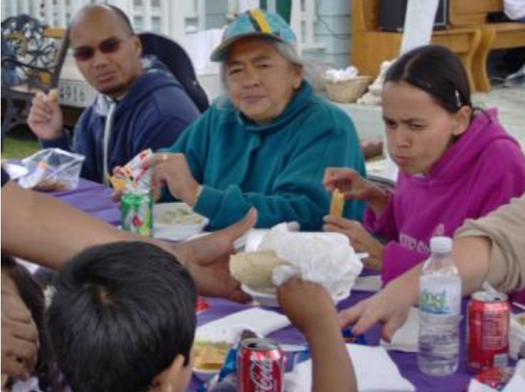
Volunteers enjoying a well deserved brake