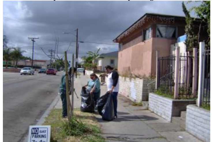
The Yellow Team left the West-side of Euclid Avenue [District 3, Councilmember TONI ATKIN'S] completely clean and litter FREE.