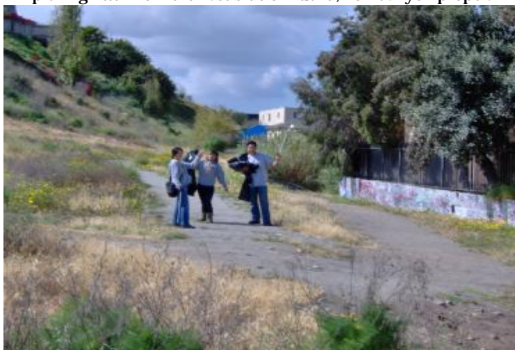
The BLUE TEAM, under the able leadership of Michael Olaes had the responsibility to clean the south part of the Auburn Creek and lower Auburn from the Pork-chop to Loris Street. Pictured here are the Blue Team volunteers picking trash/litter on Ontario Avenue.