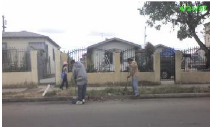
Although NOT officially part or members of the Fox Canyon Neighborhood Association service area, Winona Avenue residents happily joined the RED TEAM, and came out in force to give their street one of the best once-over in the street's lifetime using their own brooms and gardening equipment.