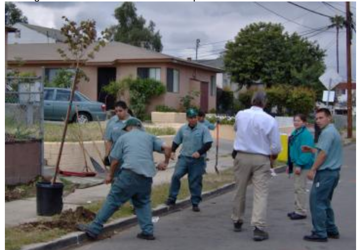
The Urban Corps and the Green Team planting trees in Lantana

The entire Fox Canyon neighborhood was given a thorough once-over cleanup. In addition, Winona Avenue [from University to Landis, to the edge of the creek] was the subject of a very especial and inclusive cleanup. Twenty [20] street trees were planted in the parkways of Lantana, Wightman and Auburn Drive with the rest of the trees [63] coming at a later date on the Urban Corps schedule.