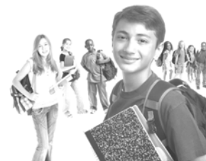
Neighborhoods working Together

Our focus during this discussion is to bring awareness to the community and educate people