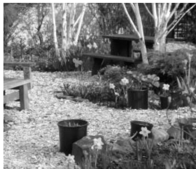
Signs of Spring (soon to appear again) in the Pacific Street Brooklyn Bear's Garden

A grass-roots, City-wide campaign of community gardeners, greening organizations and advocates of open space came together to build public support for saving the gardens from the auction. Many of the volunteers who campaigned against the destruction of the gardens took their protests to the streets during rallies and marches, and to the halls of City government during public hearings. Some lost their freedom when arrested and jailed for openly advocating to "Save the Gardens."