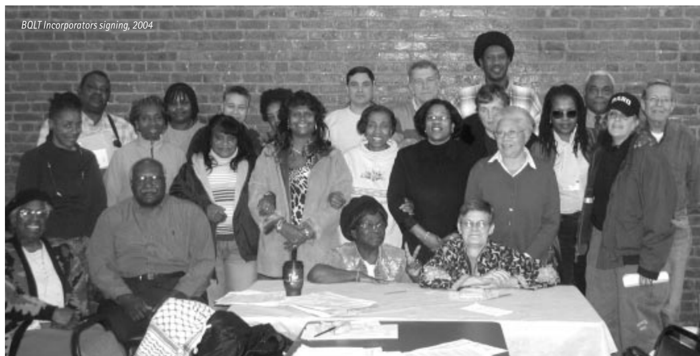
BQLT Incorporators signing, 2004