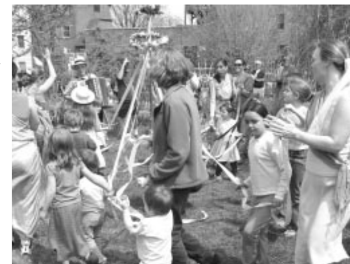
Spring Fest at 615 Green (Sixth Avenue at 15th Street)