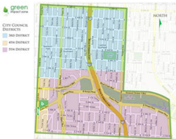
The Green Impact Zone involves five neighborhoods and three City Council districts.

All of the Historic Manheim Park Association and portions of Ivanhoe, Troostwood of the 49/63 Neighborhood, Blue Hills, and Town Fork Creek are in the 150 square blocks designated as the Green Impact Zone.