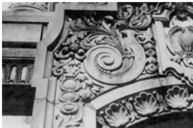
Detail of University Baptist Church in Austin