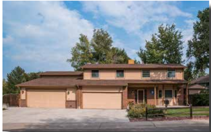
7242 S Yarrow Way