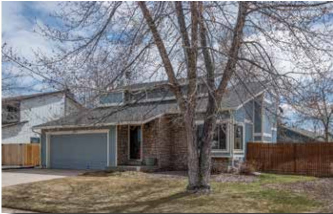
7684 W Plymouth Pl.