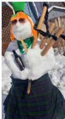
Meet Sheamus FitzFreezin, your friendly neighborhood bagpiping snowman. He's wearing O the green and ready for St. Patrick's Day! :)

Thank you so much for all the amazing snow creations.