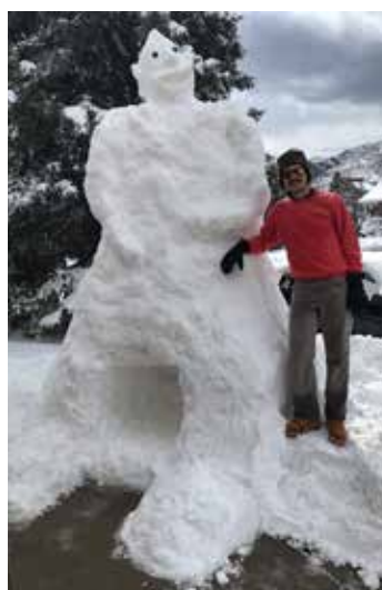
Snowmonster, 10' tall