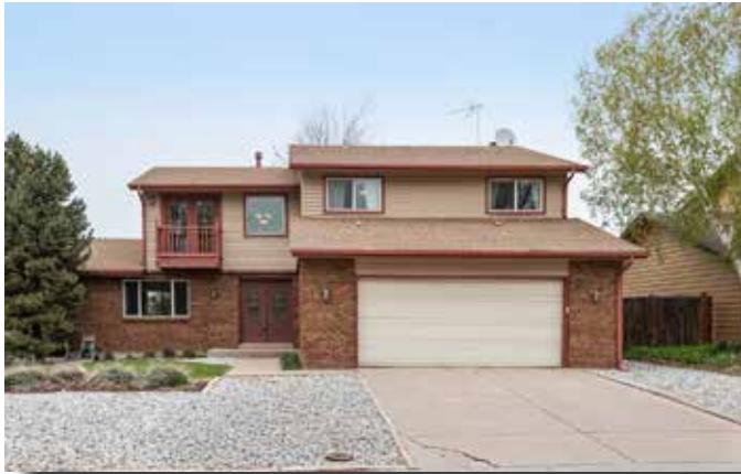
7739 W Fremont Ave.