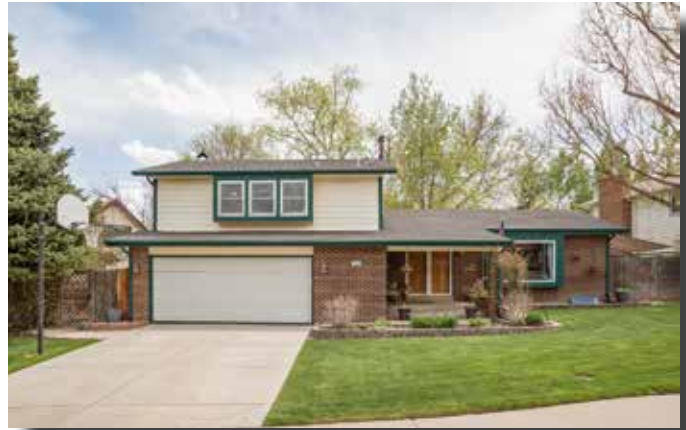
7588 W Frost Ave.