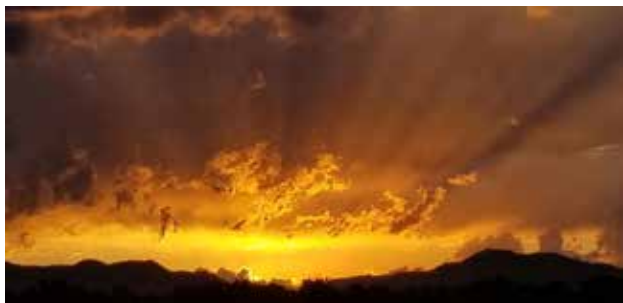
Photo of the Month..."From the back deck of W Plymouth Pl. One of my favorites!"