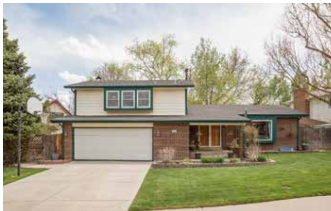
7588 W Frost Ave.