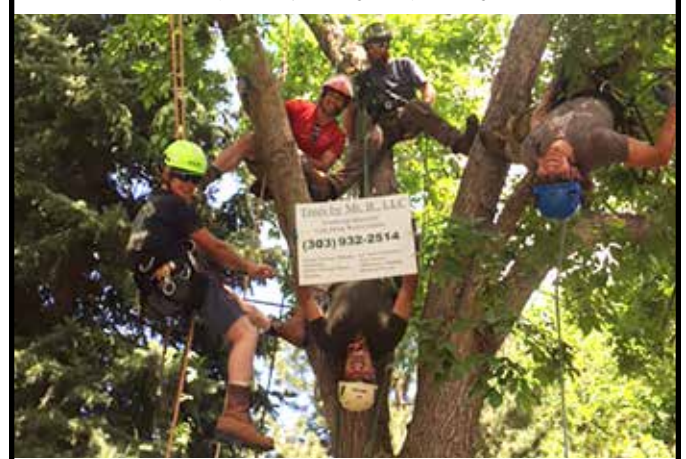
WE MAKE YOUR TREES AND SHRUBS WHAT THEY CAN AND SHOULD BE... ENJOYED.

Serving the area for over 25 years WITH 40+ YEARS EXPERIENCE