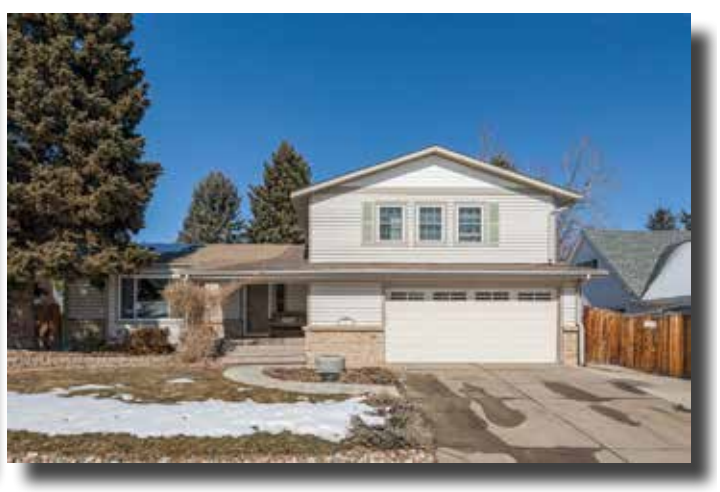
7863 W Quarto Ave.