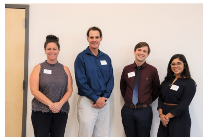
New MV Teachers

July 2019 – Glendale Union High School District recently held its annual New Teacher Dinner that proudly welcomed 63 new teachers who will contribute to the GUHSD Excellence.