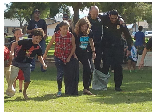
3 Legged Race from CPW Gain Event 10/20/19

Or Donate Online via PayPal - laddisluv@hotmail.com (Make sure to choose the gift)