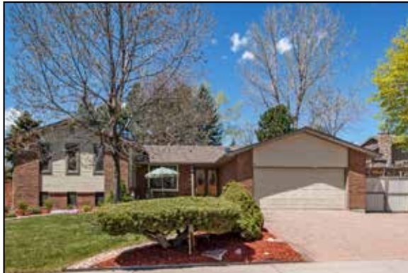
7811 S Lamar Ct.