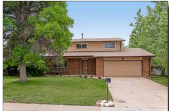
6165 W Morraine Ave

Duane sells more homes in the Columbine area than any other broker!