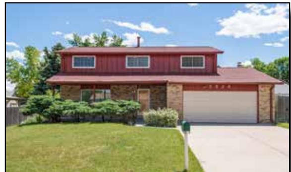
5828 W Ken Caryl Pl