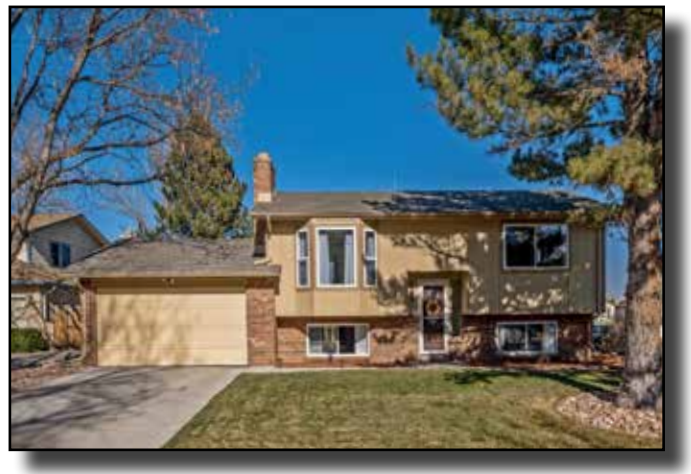
6886 S Wadsworth Ct.