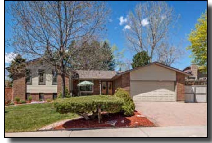
7811 S Lamar Ct.