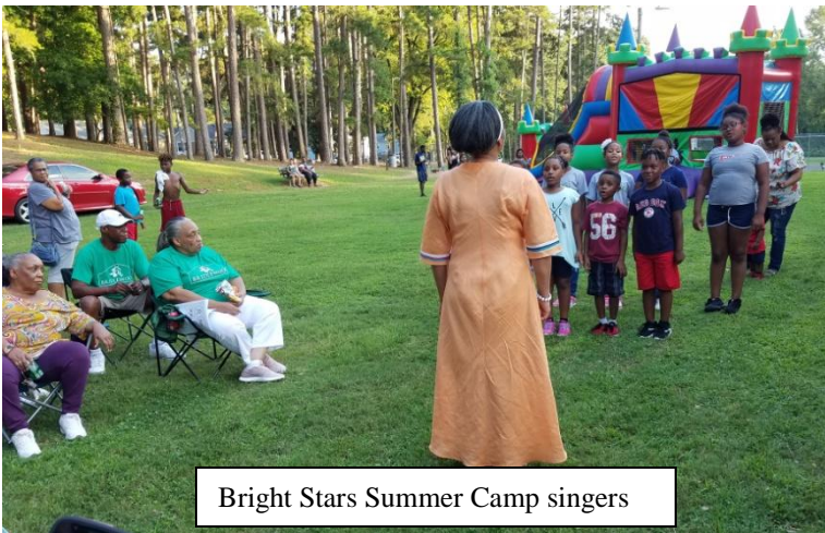
Bright Stars Summer Camp singers