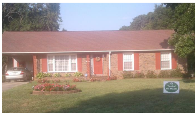
Home of Grover Copeland 5700 Craftsbury