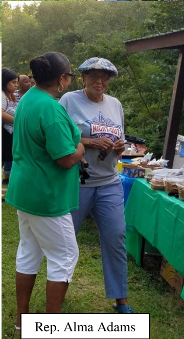
Rep. Alma Adams