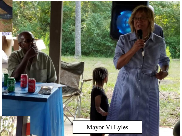
Mayor Vi Lyles