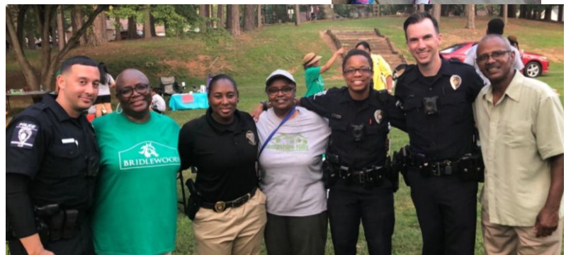
North Tryon division police officers with neighbors.