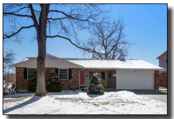
6210 W Canyon Ave