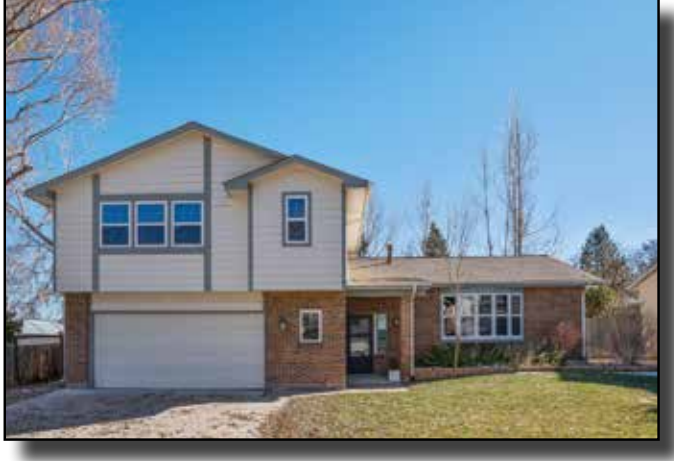
7638 W Frost Dr