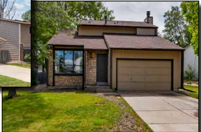
7664 W Plymouth Pl