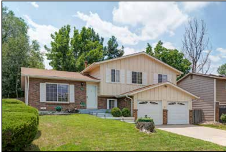
7776 W Ottawa Dr