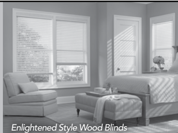
Enlightened Style Wood Blinds

25% off Enlightened Style™ Window Coverings*