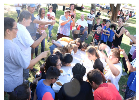
Row 1: MV NJROTC present colors, Cholla Middle School sings National Anthem, neighbors stand for Anthem. Row 2: Volunteers ready to serve food, neighbors in line to eat, neighbors enjoying the day. Row 3: More neighbors, Phx PD posing, more neighbors. Row 4: Crunch Fitness booth, AZ Clowns and kids, American Legion Post 105 booth. Row 5: 3 legged race, bottle tip it players, pie eating contest