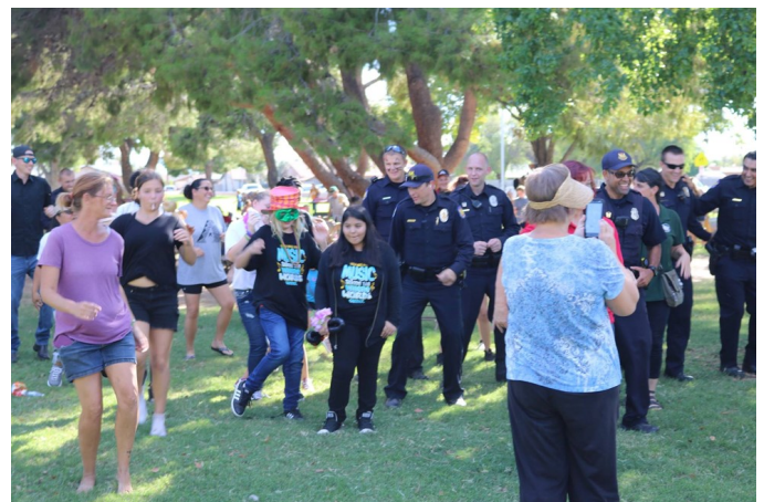
Cholla Students with neighbors and Phx PD dancing