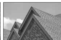
Roof Replacement & Insurance Claims