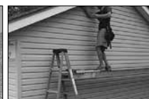
Vinyl & Cement Board Siding