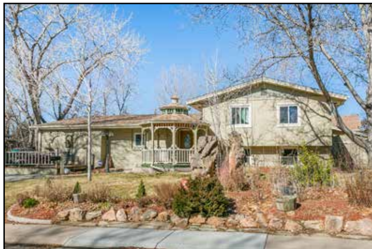
7767 S Depew St