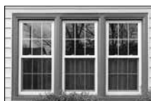
Energy Efficient Replacement Windows