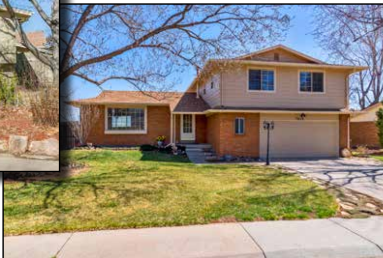
7618 S Lamar Way