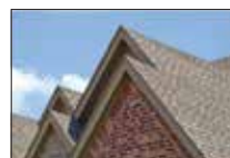
Roof Replacement & Insurance Claims