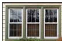
Energy Efficient Replacement Windows