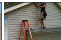
Vinyl & Cement Board Siding