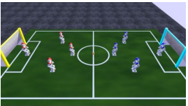
ground October 18, 2016.

“Suntrust Park” is currently on schedule to open in April of 2017. The Atlanta United FC Training Center is near completion and construction on the $7 million Franklin Gateway Sport Complex broke