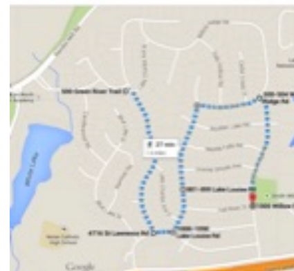
Mayor Walking Route

Suitable for all ages and abilities, you are invited to walk and visit personally with the Mayor. The 1.4 mile route follows the Fourth of July parade route, beginning on Green River Trail at Chandler Lake and proceeding south toward Saint Lawrence.