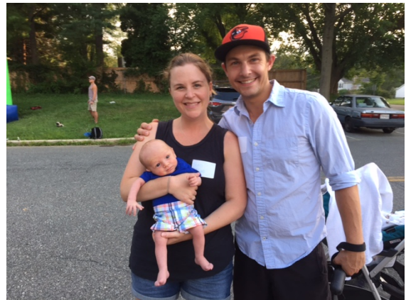
New Manor Lake neighbors at NNO 2016.