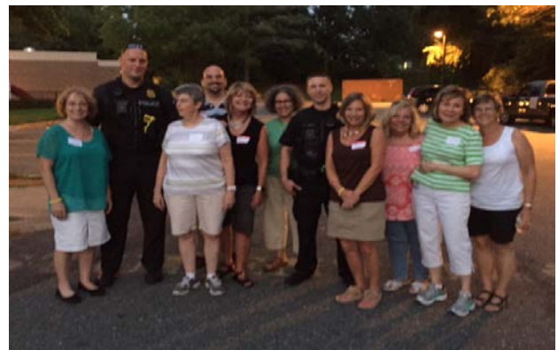
NNO Volunteers with Local Police and Firefighters.