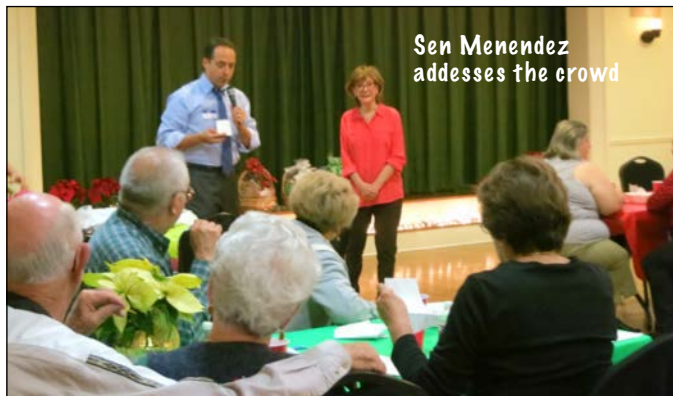
Sen Menendez addresses the crowd