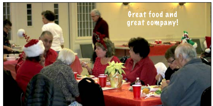
Great food and great company!