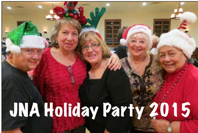
JNA Holiday Party 2015

Preserving the Integrity of the Jefferson Area Since 1982