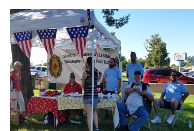
Row 1: Neighbors, police, LC of DJ L Boogie, kids enjoying the bouncy cages Row 2: MV kids and neighbors PR and Diane cooking & serving food, Row 3: Neighbors enjoying the day. Row 4: MV students face painting and ping pong toss. Row 5: Pie eating contest, Cholla Middle School Band, 3 legged race. Row 6: Booths: SinghsmileCare, Kaity's Way & American Legion Post 105 Visit our website to view more photos at www.facebook.com/cpwna