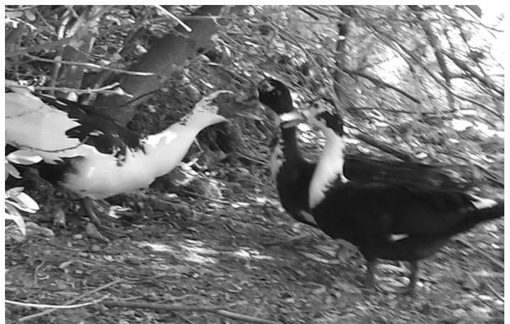
Webster & "The Girls"