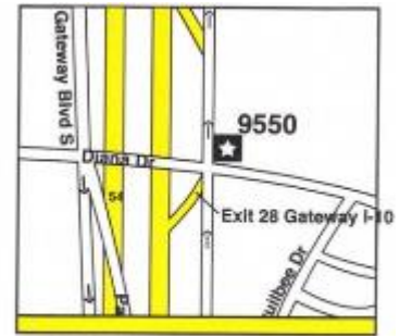
OLD GLORY MEMORIAL 9550 GATEWAY NORTH EXIT 28 GATEWAY NORTH & DIANA DR.