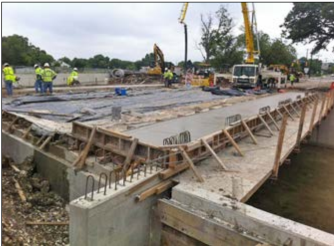
Wilson St. bridge sidewalks