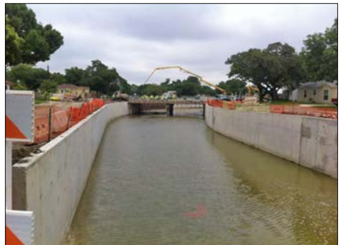
More water from recent rains