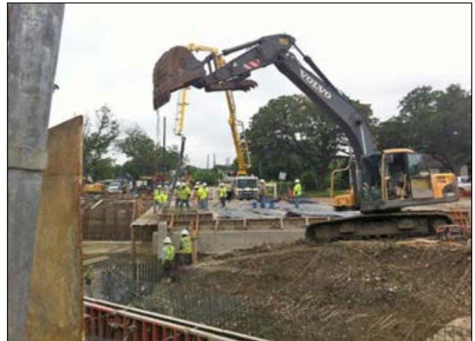
Wilson St. bridge