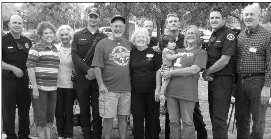
PCHA residents and officials during NNO

An additional note is that the city of Arlington takes NNO very seriously. As