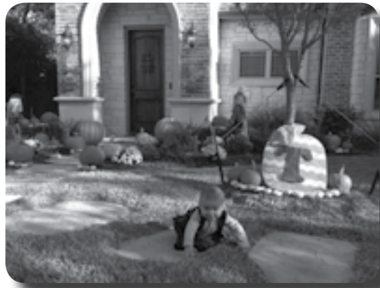
October Yard of the Month 8934 San Leandro Dr.

I look forward to perusing the neighborhood and selecting recipients for the new year. If you have a yard you would like to nominate, please send the address to kevowell@yahoo.com .