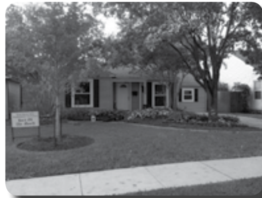
October Yard of the Month 8623 Santa Clara