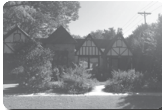
November Yard of the Month 8600 San Fernando Way