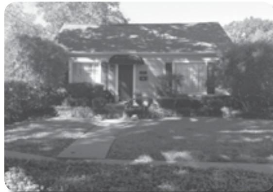
December Yard of the Month 8923 Daytonia

To report any construction problems with the Arboretum Parking Garage being built across from the Children's Adventure Garden contact: